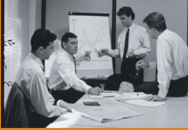
sell/price their products and services