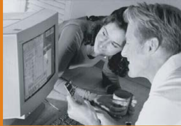
process orders and structure transactions