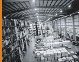
arrange their workflow and warehouses