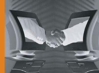
partner with suppliers and principals